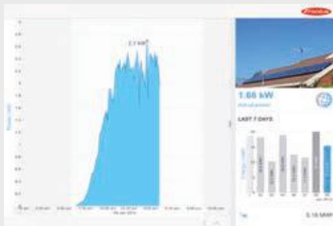
Fronius Solar.web App