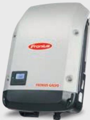
/ FRONIUS GALVO 1.5 - 3.1 kW 1-phase

perfectly optimised for your self-consumption system. Now, for the first time, the inverters are also equipped with a WLAN interface inside the device. Your photovoltaic system is therefore wirelessly connected to the internet so you can call up your system data whenever you want.