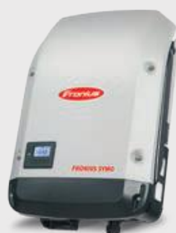
/ FRONIUS SYMO 3.0 - 20.0 kW 3-phase