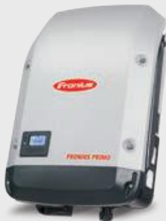
/ FRONIUS PRIMO 3.0 - 8.2 kW 1-phase